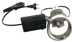
40399 For: 13320